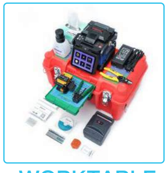
WORKTABLE CARRYING CASE